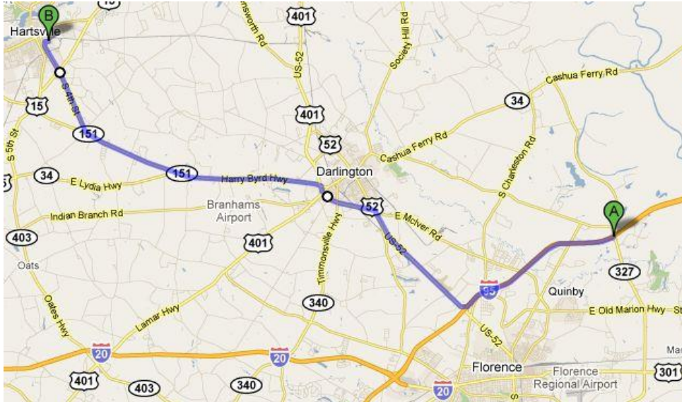
City of Hartsville Map:

From I-95 South: Merge onto Hwy 52 N toward Darlington via exit number 164. In Darlington, turn left to stay on Hwy 52. Take Hwy 34 W/ Hwy 151 toward Darlington Raceway/Hartsville. After about 9 miles, merge right onto 151 Business/S 4 th Street. Hwy 151 Business becomes 4 th Street. Continue on 4 th Street, cross the railroad tracks, and in two blocks, turn right on Coker Street. This is a Y-intersection at a church. Turn right into the front entrance of GSSM. (Approximately 40 minutes from I-95).