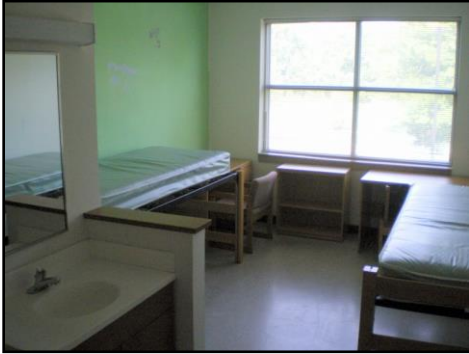
Typical residential room

GSSM's housing accommodations are suites, which are located on the second, third and fourth floors of our building. Each room is suited with another room to share a bathroom. The residential floors are accessible by elevator, and there are handicapped accessible rooms for those with limited mobility.